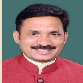
Shri Devusinh Chauhan Minister of State