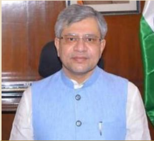
Shri Ashwini Vaishnaw Cabinet Minister