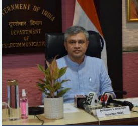
Shri Ashwini Vaishnaw Cabinet Minister