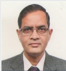
Shri Sanjeev Agrawal DG Telecom (L/A)