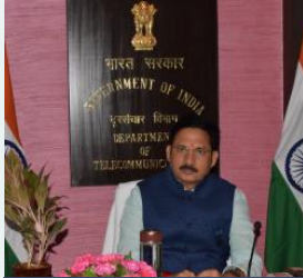
Shri Devusinh Chauhan Minister of State